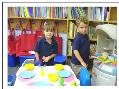
I am learning social skills while playing in the Home Center.