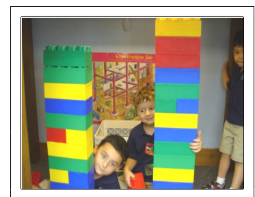
In the block center I am learning to estimate, measure, and use mathematical problem solving.