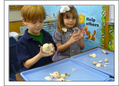
I am learning to work cooperatively and I am developing my fine motor