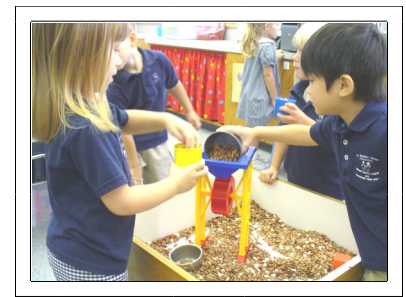
I am learning about balance, gravity and creativity.