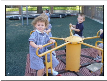
I am developing my gross motor skills and learning to following directions.