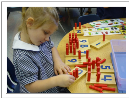
I am learning Math concepts in the Math Center