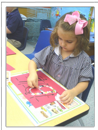
I am learning my alphabet