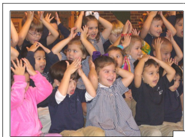
Grandparents' Day program