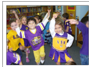
Preschoolers dressed in purple and gold for LSU Day.

for children to join in the excitement of preparing for the celebration of Christ's birth. Encourage your children to make simple Christmas cards to take to nursing homes, have them gather food to give to the needy, help them purchase a toy for a less fortunate child. These kinds of activities will help the children to experience Advent as a season for sharing, giving, and caring.