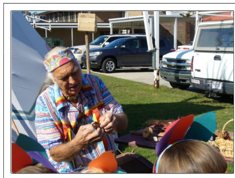
Strong Buffalo demonstrates the Indian toys.