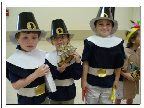
The First Thanksgiving performed by Miss