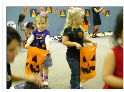
Halloween Party Fun