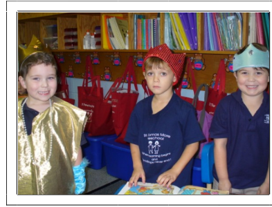
K week Kings