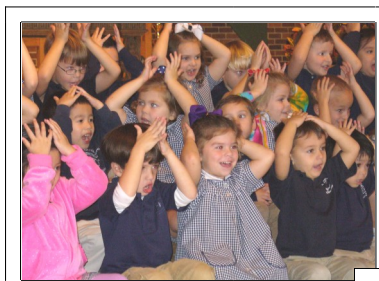
Grandparents' Day program