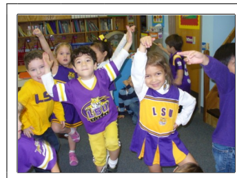
Preschoolers dressed in purple and gold for LSU Day.

for children to join in the excitement of preparing for the celebration of Christ's birth. Encourage your children to make simple Christmas cards to take to nursing homes, have them gather food to give to the needy, help them purchase a toy for a less fortunate child. These kinds of activities will help the children to experience Advent as a season for sharing, giving, and caring.